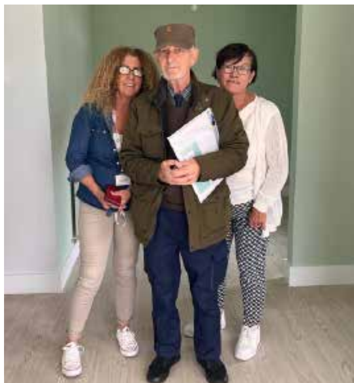
Richmond Place welcoming its new tenants

A strong focus on community, safety, and dignity as people age