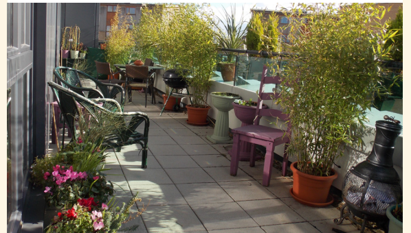
Thanks to Peter & Anne for letting us show a picture of their wonderful balcony in Ashtown. Well done on creating such a beautiful space!